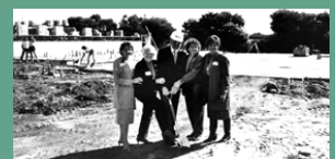
MONTE VISTA AVE. STREET EXTENSION AND OVERPASS