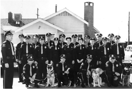
MONTCLAIR POLICE DEPARTMENT 1961