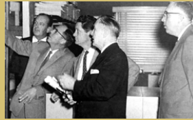
EARLY CITY PLANNING