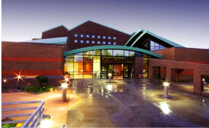
NEW POLICE FACILITY 2008