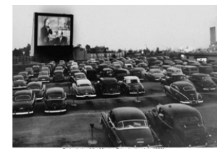
Early photo of the Mission Drive-In circa late 1950's

In 1948 , The Valley Drive-In was the first drive-in to open in Montclair. The second drive-in to open in 1956 was the Mission Tiki Theater, located on Mission Boulevard.