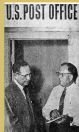
MONTCLAIR POST OFFICE OPENED IN 1957