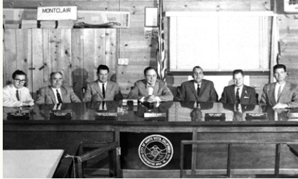
MONTCLAIR'S FIRST CITY COUNCIL, 1958

Residents who were with the City at its founding recall a simpler life, when Montclair was a collection of orange groves and ranch houses. Residents who came later to the community may only know Montclair as a town that embraces the typical concepts of suburban California. No matter your perspective, the significant events a community builds on resonate and have meaning for each of us, giving rise to an energizing experience. These events shape our sense of who we are, individually and collectively. Like the documentaries on television that memorialize the anniversaries of important events, this newsletter, and others before it, help tell the Montclair story.