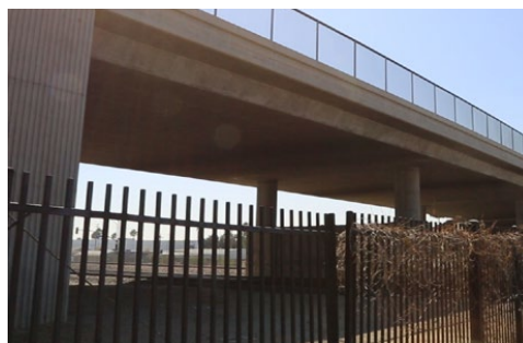
RAMONA BRIDGE GSP

• Widening of Monte Vista Avenue at the I-10 Freeway is part of a regional widening of the freeway to add express lanes through San Bernardino County. The widening will eliminate traffic congestion and improve access to North Montclair.