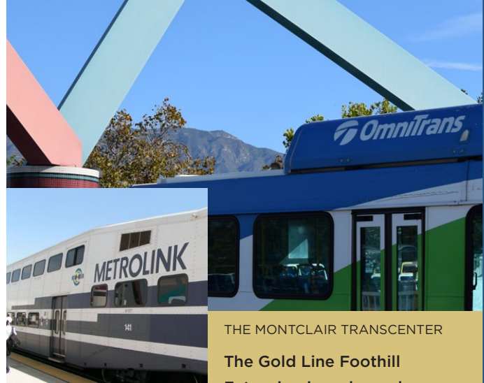
THE MONTCLAIR TRANSCENTER

The Gold Line Foothill Extension is a planned