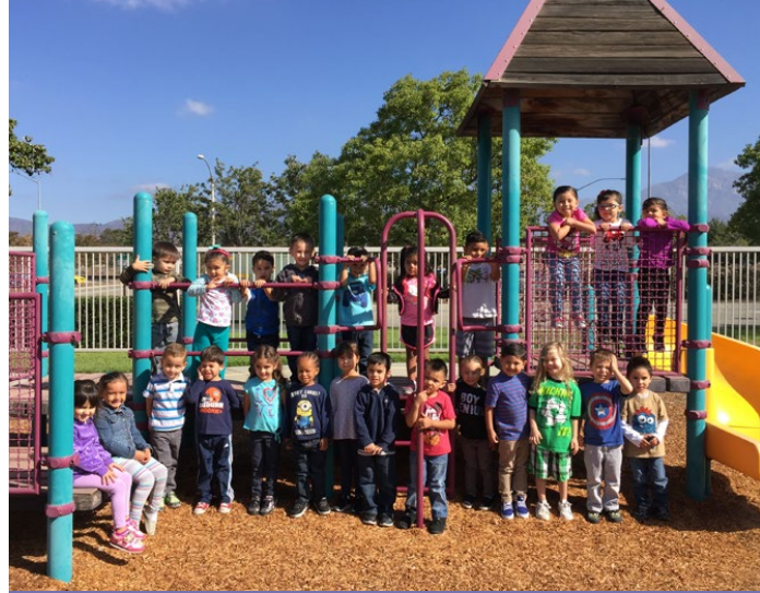
MONTCLAIR MINI SCHOOL AT TRANSCENTER