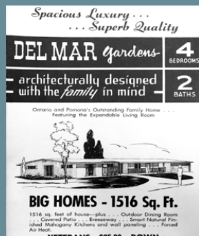
BIG HOMES - 1516 Sq. Ft.