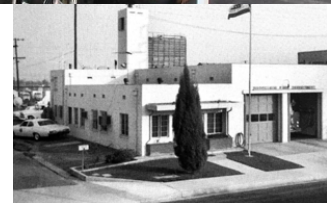
ORIGINAL FIRE STATION, 1967

The Fire Department's new 2014 KME fire engine was purchased with Federal funds and is equipped with the latest communications equipment and has adequate compartment space to store equipment that is needed to respond to a multitude of incident types.