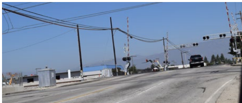
SITE OF FUTURE MONTE VISTA GSP