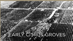
EARLY CITRUS GROVES