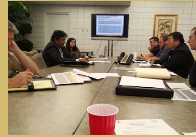
PLANNING MEETINGS FOR MONTE VISTA GRADE SEPARATION PROJECT

The list of public facilities and infrastructure projects completed during this last decade demonstrate a city hard at work for residents and the business community.