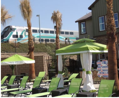
ARROW STATION, A 129-UNIT RESIDENTIAL DEVELOPMENT, NEAR THE TRANSCENTER, AND PASEOS, BELOW.