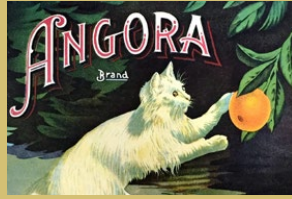
ANGORA ORANGE CRATE ART