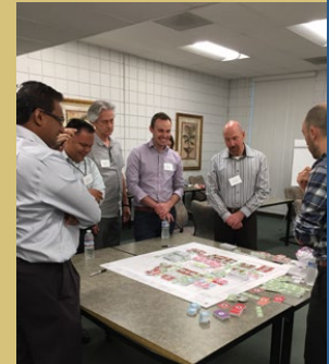
PLANNING FOR GOLD LINE