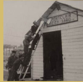
ORIGINAL CITY YARD ON ARROW HIGHWAY