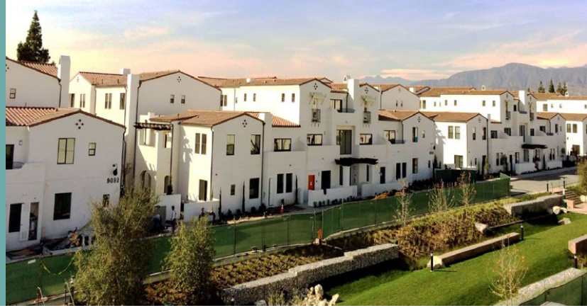
The Paseos, a 385-unit residential community built around a public park. The fully leased development is a walkable community close to the Metrolink at the Montclair Transcenter.