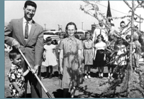
CIVIC CENTER DEDICATION