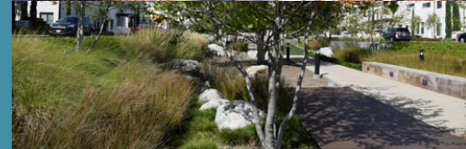
STREETSCAPE SUSTAINABLE LANDSCAPING