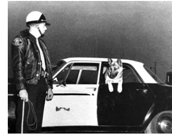
CANINE "MACE", 1963