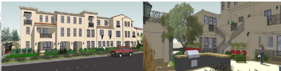
Vista Court, a 23 unit project approved on July 5, 2016. The 3-story residential project features a Spanish Colonial inspired design, courtyard area, and tuck under parking. Construction is anticipated to begin in early 2017.