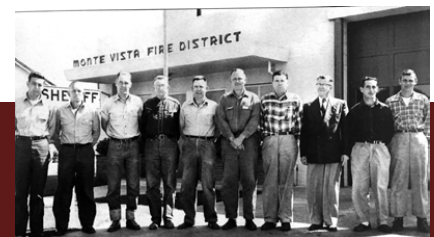
MONTE VISTA FIRE DISTRICT, 1953