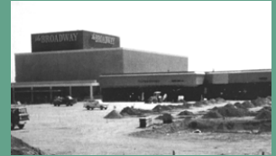
HOMART STARTED MONTCLAIR PLAZA EXPANSION