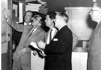
EARLY CITY PLANNING 1957