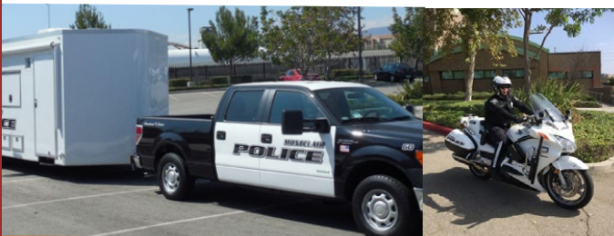
MOBILE COMMAND TRAILER, 2014