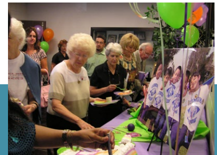
MONTCLAIR COMMUNITY COLLABORATIVE