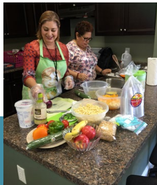
POR LA VIDA HEALTHY COOKING CLASSES