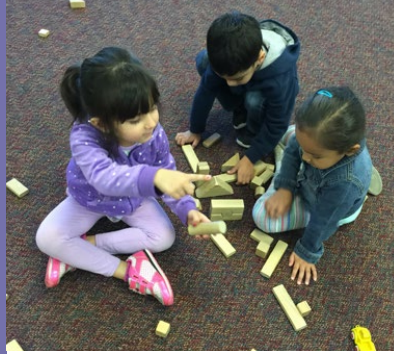
MONTCLAIR MINI CAMP AT TRANSCENTER