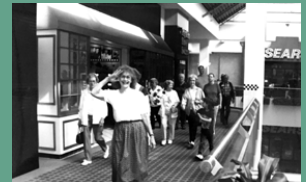
DEDICATION OF MONTCLAIR EAST SHOPPING CENTER