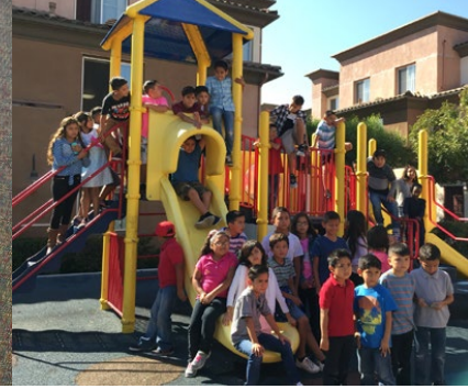
AFTER SCHOOL PROGRAM AT MONTE VISTA MIDDLE SCHOOL