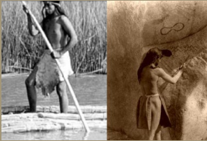
SERRANO AND GABRIELENO NATIVE AMERICAN TRIBES