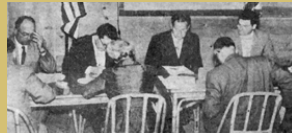
CITY OF MONTE VISTA INCORPORATES 1956